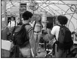
Environmental Studies students work at the Intervale.