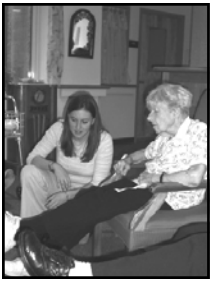
Physical Therapy students work with residents of Cathedral Square Assisted Living.